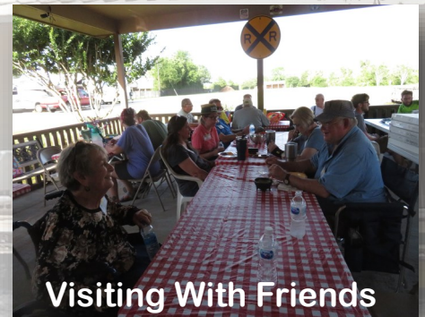
Visiting With Friends

Early arrivals welcome on Thursday afternoon. Late departures before noon Monday are encouraged. SWLS members and other live steamers are welcome. An on-site RV host will open the park about noon on Thursday and close it about 2:00 pm on Monday. Meal details will be posted closer to the meet. Bring your Gauge 1, 4.75 inch and 7.5 inch gauge locos and trains.